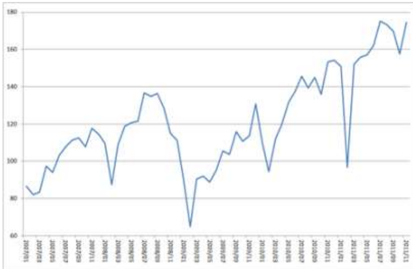
Graph 1: China's Monthly Export Amounts (Billion Dollars) Trends and Characteristics of Chinese Transition to IT industry